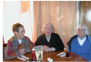
Boston Bayram Photos:

As usual, the food, conversations and company were great!